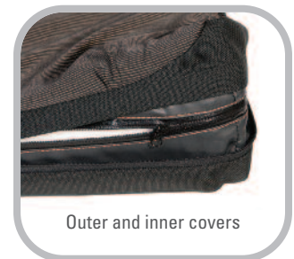
Outer and inner covers